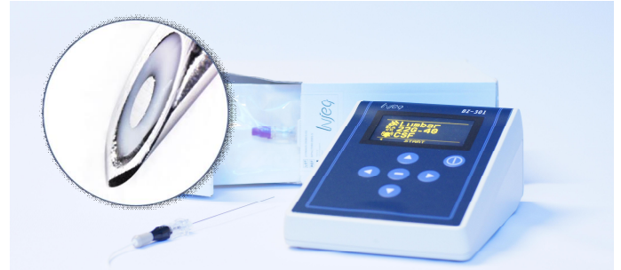
Equipment: Bioimpedance from the tip & Real-time tissue analysis

A lumbar puncture (LP) for cerebrospinal fluid (CSF) sample is essential for diagnoses. The procedure is challenging, especially in neonates, and high number of the punctures fail or are traumatic. Injeq IQ-Needle™ (IQ-Needle) is developed to provide immediate alert when the needle tip enters CSF. Earlier study in adults showed successful results and now the method is tested in pediatric LPs. Aim is to test feasibility and performance of the device to detect CSF during pediatric and neonatal LP.